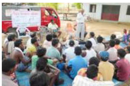
A month long campaign we organised in May 2012

Through our programmes we tried increasing knowledge and awareness amongst farmers about increasing production of various crops; also about various farmer friendly programmes initiated by Government of India and State government such as Front Line Demonstrations and Extension through network of Krishi Vigyan Kendras (KVKs), National Mission of Agricultural Extension & Technology (NMAET), National Food Security Mission (NFSM), Soil Health Management Scheme, Mission for Integrated Development of Horticulture (MIDH), Bringing Green Revolution to Eastern India (BGREI) and Rashtriya Krishi Vikas Yojana (RKVY).