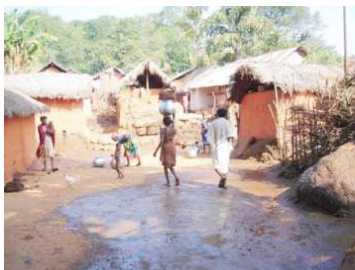
Soruguda village of Nandahandi Block in Nabarangpur district

Then time came to identify a suitable location for us to set up office in our area of operation. Nabarangpur district was chosen for the same being almost in middle of the 8 districts of KBK region. In Nabarangpur we chose Nandahandi block to work from. We managed setting up an office in Soruguda village of the said block.