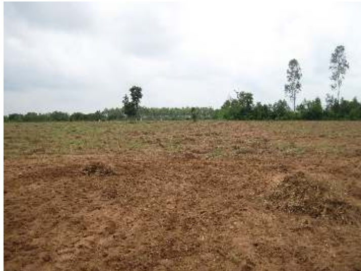
31 Acres of land purchased by Govindalaya in village Soruguda

On 22 nd September 2012 we purchased 31 Acres. of land in the same village which is about 10 Kms. away from Nabarangpur District Collector's office. Idea behind purchasing land was to create belongingness amongst the local staff and villages. One of the primary reason locals in our region not effectively participating in development projects is that the implementing agencies fail in creating acceptability amongst the locals for lack of organisational resources in the vicinity. Another important reason of owning land is to shape the organisation in a sustainable manner without depending much on aids from different agencies. The land can be utilised to raise revenues for the organisation in due course of time.