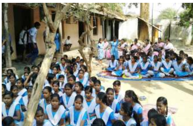
Science exposure programme conducted in a rural school of Nandahandi Block for students of Primary Schools in 3 rd week of January 2015