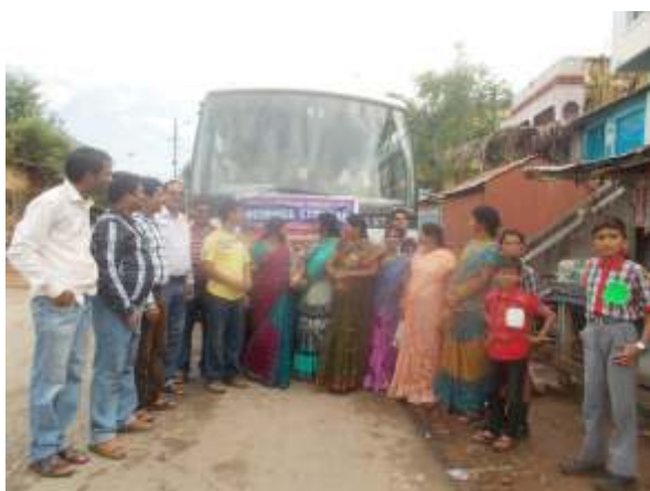
Science exposure programme conducted for Primary Teachers on 16 th July 2014