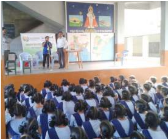
A science awareness programme conducted in association with Ascent Classes in a Telugu School on 11 th and 13 th February 2015