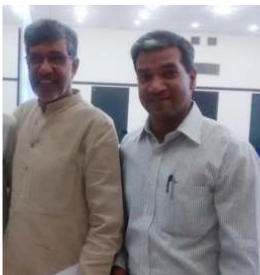
Chairman of Govindalaya met Nobel Laureate Shri. Kailash Satyarthi and drew his attention to the plight of children of KBK region: 30 th March 2015