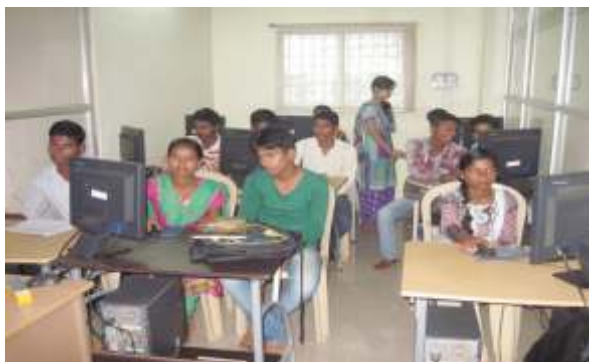
Computer Centre and free internet facilities set up with the 20 computers donated by Infosys

In the year under reporting we trained more than a 1000 persons including house wives, farmers, school and college going children, small businessman, school teachers and local lawyers. We have been offering short term courses (ranging between 1 week to 2 months) and long term programmes (ranging between 2 months and 1 year) to cater to the needs of our learners.