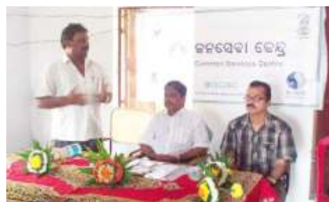
Inauguration of 13 Common Service Centres granted to Govindalaya by OCAC officer.

Govindalaya became VLE in about 13 panchayats of 5 adjacent CD Blocks i.e. Nandahandi, Umerkote, Papdahandi, Nabarangpur and Borigumma. Appointed and trained village youth to manage CSCs at Grampanchayat headquarters. Out of the little business linked voluntary contribution made by these 13 VLEs, we are now training another batch of VLEs. Through this approach we aim at setting up and effectively manage CSCs throughout 80 Blocks of KBK region thereby creating employment avenues for about 400 village youth before end of 2016.