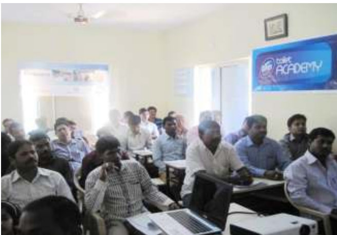
Staff availing entrepreneurship training conducted by Hindustan Uniliver, Domex and e-Kutir at Bhubaneswar: 21 st February 2015.

In the year under reporting we availed various kind of training for our staff