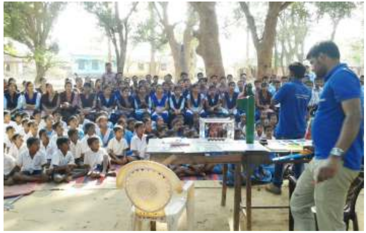
A fun filled science workshop we conducted on 25 th August 2014 at R.C.D. High School Nabarangpur with volunteer support from vikram sarabhai science foundation.