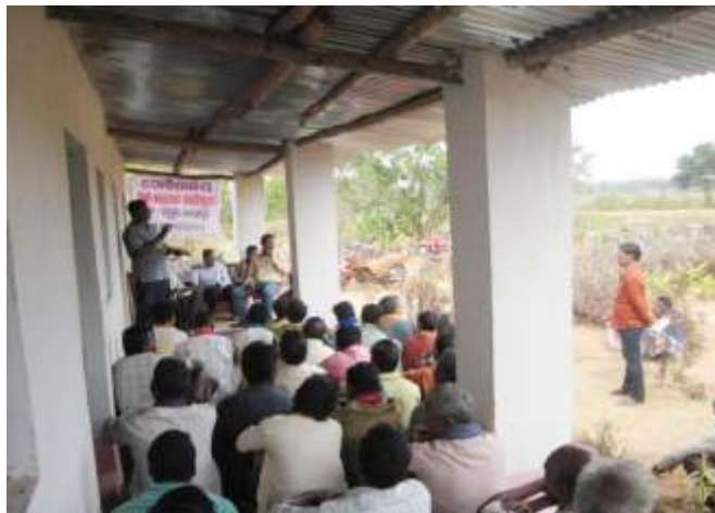
Farm-Scientist & Farmers meet organised on 21.12.2014. Resource Persons were from KVK, Umerkote.

Distance Education, Video Project, Agricultural Technology Information Centre (ATIC), Kissan Call Centre (KCC) and Orissa Gender Resources Centre (OGRC). With such support we could regularise Farmer-Farm Scientists' interactive meetings at our Centre of Empowerment. In total we conducted 4 such interaction-cum-training session during the year under reporting. Farmers' from all 10 Panchayats of Nandahandi Block of Nabarangpur district benefited from such sessions. Total attendance this year was 1163 which involved landless farmers as well as women farmers.