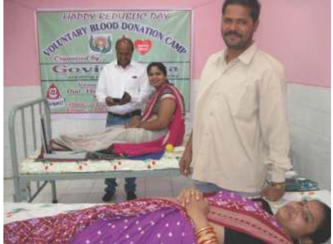
Blood donation camp organised at DHH Blood Bank, Nabarangpur on 26 th January 2015